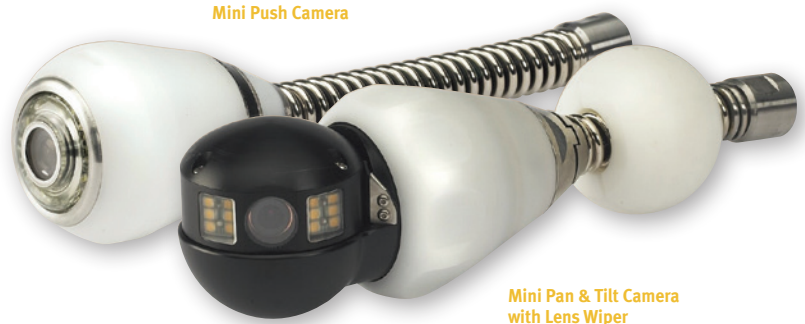
Mini Push Camera

A centered push cable on the underbody of the tractor maximizes cable bending for easier launching. The open drive system is self-cleaning, eliminating sludge build-up for maintenance-free operation.