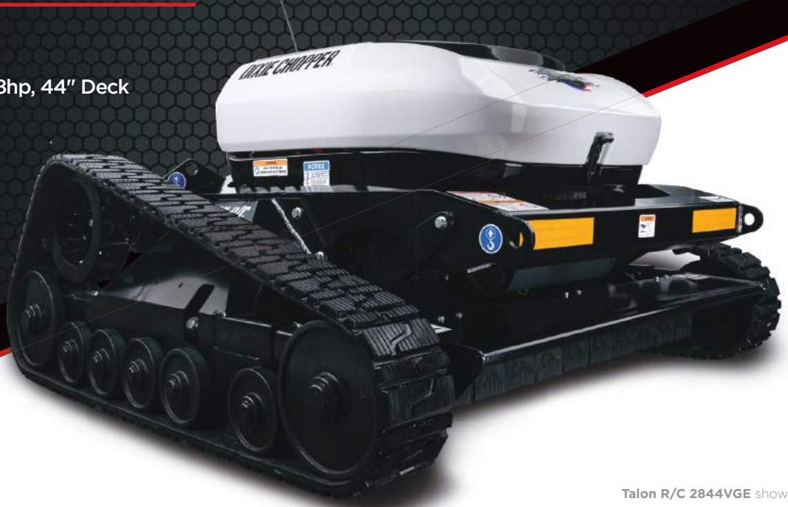
Talon R/C 2844VGE shown