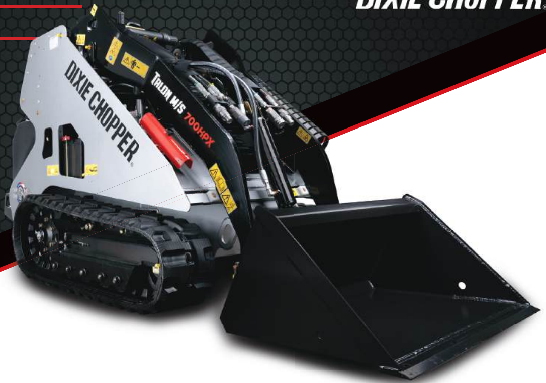
Talon M/S 700HPX shown