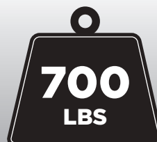
Heavy Loads - Get more work done with 700+ pounds of operating capacity