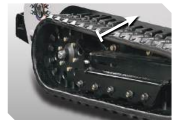
Expandable Tracks - Narrow for tight spaces or wider for better stability